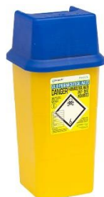
Figure 2 - Blue-topped yellow ridged bin

All waste medicines outlined must be placed into a 7ltr, 11ltr, or 24ltr blue lidded , clinical waste box.